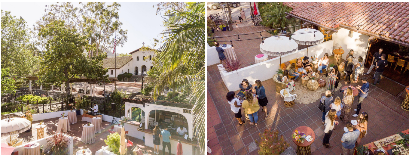
Magnolia Patio with Outside Bar option & Mission View Patio *Pictured with linen upgrade & rental furniture from Avenue Twelve

Luna Red has many semi-private event spaces both indoors and on our patio. The best part is the flexibility! Many of the spaces can be combined in order to meet the size requirements of your event. The standard allotted time for non-buyout events is 2.5 hours . We take reservations beginning 15 minutes after the contracted departure time. Our food & beverage minimums vary by time of year and venue.